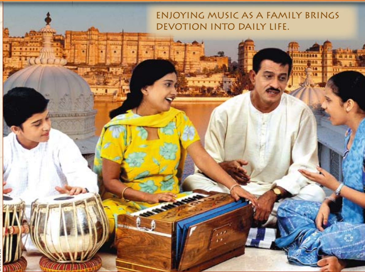
ENJOYING MUSIC AS A FAMILY BRINGS DEVOTION INTO DAILY LIFE.