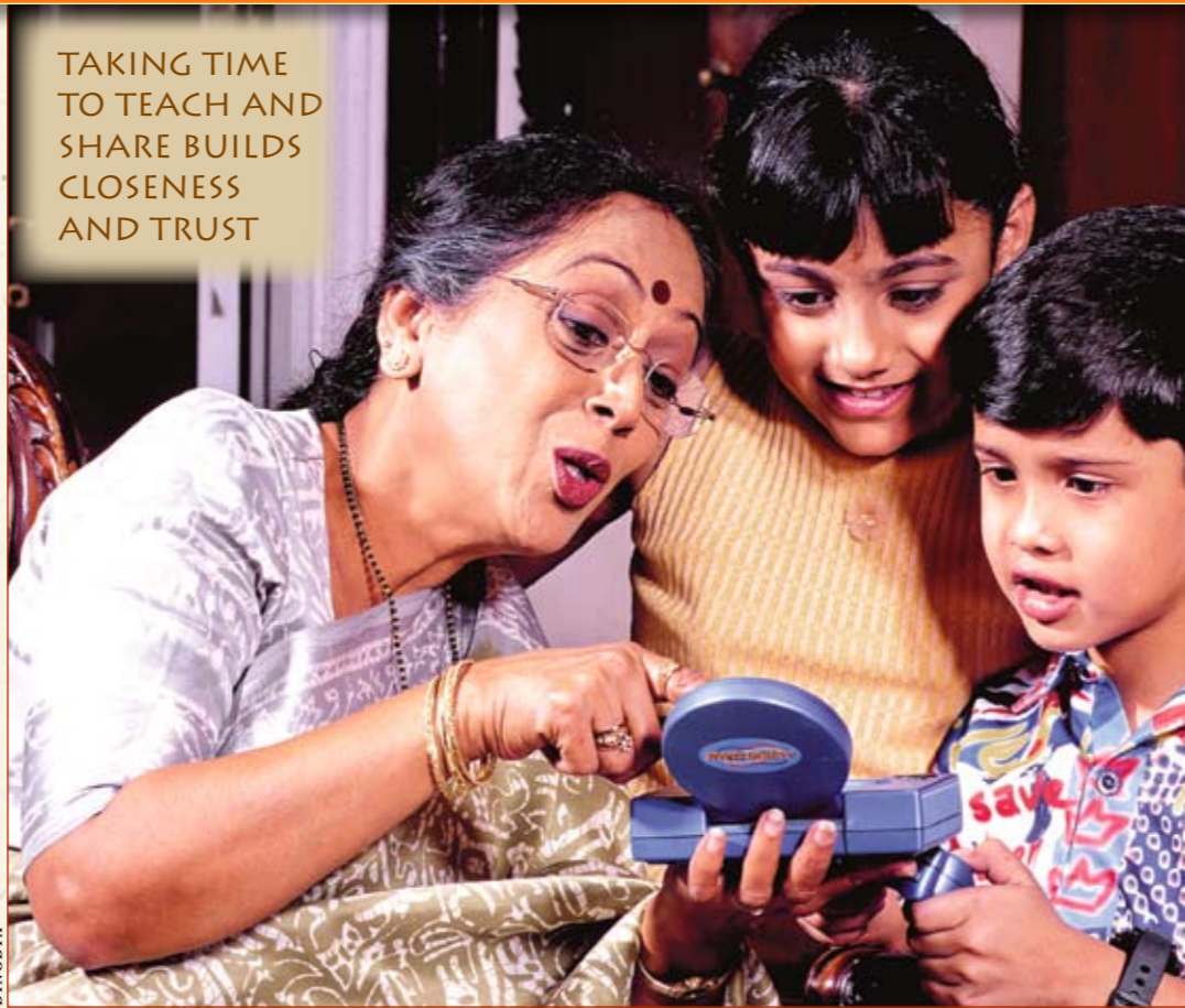
Teach the correct meaning of the Vedic statement “Truth is One, paths are many.”

Some Hindus teach their children that all religions are one, thinking this is a way to describe Sanatana Dharma’s broad vision. However, this is a problematic distortion of the Hindu belief that truth is one, paths are many. Teaching this to children will cause them to be half-hearted Hindus, never fully committed to their faith and not inspired to pass it on to their offspring. I have seen this attitude