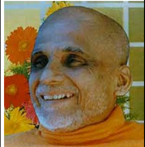
Sri Swami Krishnananda

SERVE, LOVE, GIVE, PURIFY, MEDITATE, REALIZE So Says Sri Swami Sivananda