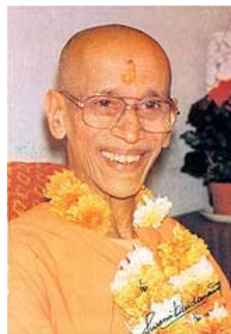
Sri Swami Chidananda

SERVE, LOVE, GIVE, PURIFY, MEDITATE, REALIZE So Says Sri Swami Sivananda