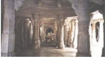
Jain temple in Ranakpur

Jainism has been a major cultural, philosophical, social and political force since the dawn of civilization in Asia, and its ancient influence has been traced beyond the borders of modern India into the Middle Eastern and Mediterranean regions. At various times, Jainism was found all over South Asia including Sri Lanka and what are now Pakistan , Bangladesh , Myanmar and Afghanistan .