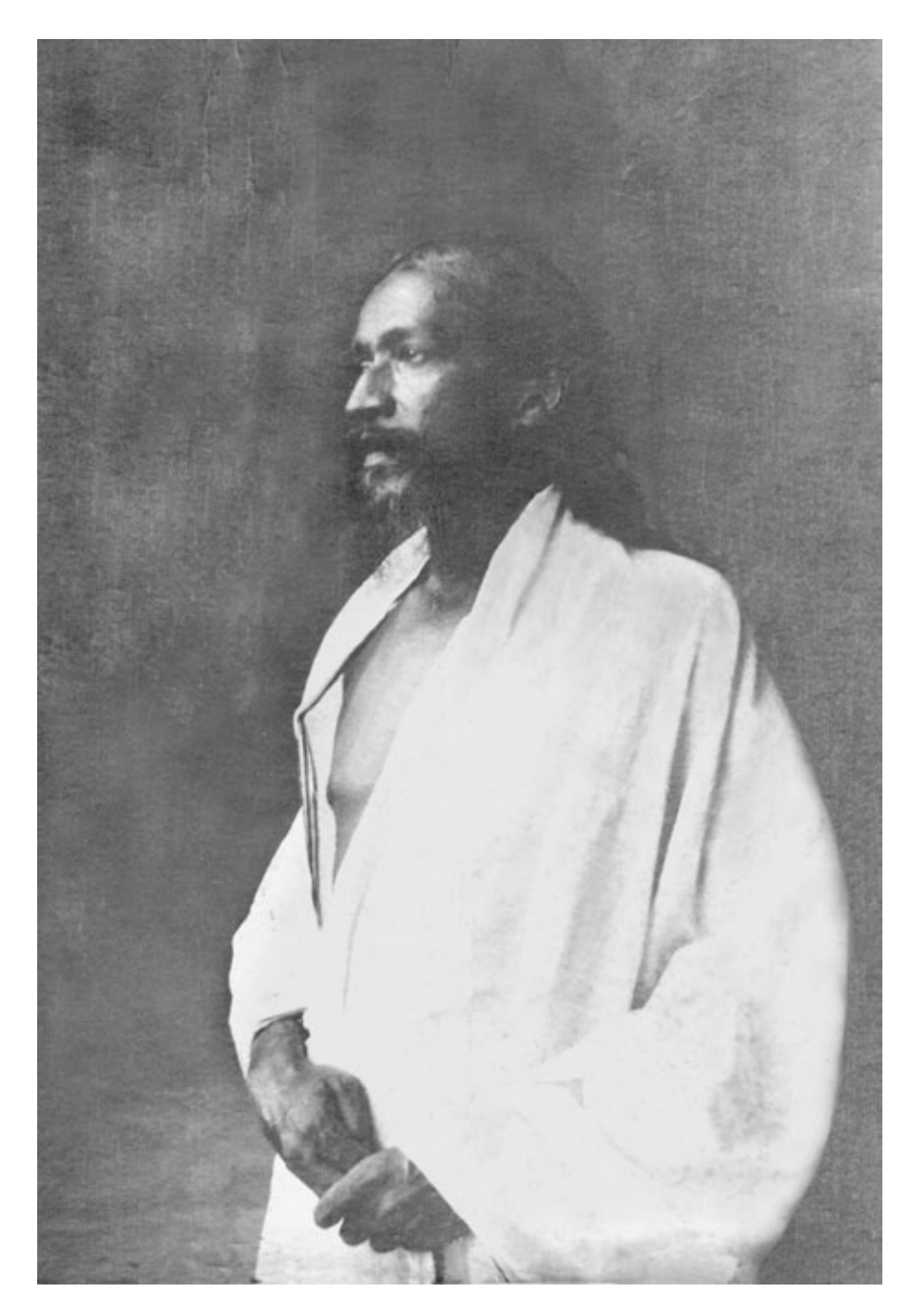
Sri Aurobindo in Pondicherry, c. 1915